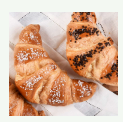
Morning Goods Sample Box